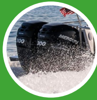
Out- or inboard engine