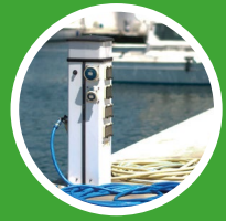
Shore- Grid power